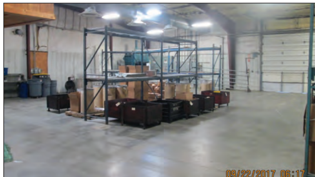
Callaway County Extended Employment in Fulton is developing a new commercial laundry service to expand its ability to provide employment for people with disabilities.