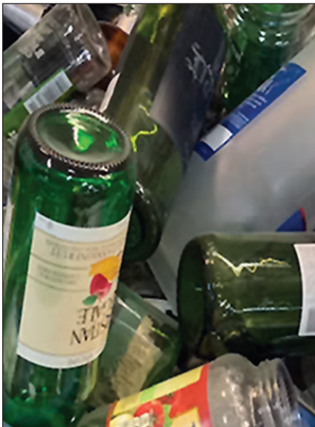
2 Rivers Industries in Hannibal has launched a glass recycling effort. Manager Melonie Nevels reports that the shop has begun recycling glass products and turning them into usable sand products that can be used for sandblasting, swimming pool filters and landscaping.